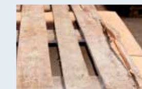
Stringer, partially or fully fractured board