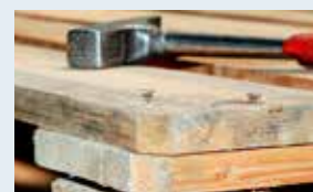
Hammering down projecting fastening elements