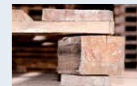
Skewed block > 1cm