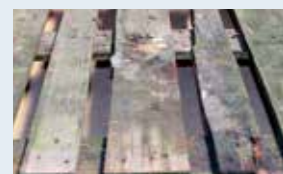
Drying/cleaning soaked boards