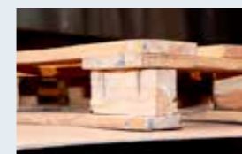
Visible fastening elements e.g. nails