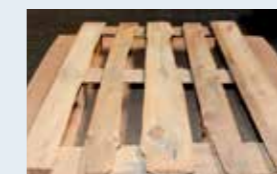
Inadmissible component e.g. under-dimensioned, woodworm-eaten, wane