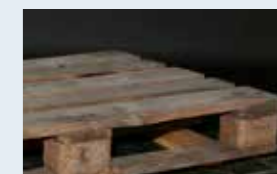
No longer any prescribed identification legible